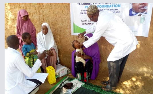
Health workers administer the Rota virus vaccine to a child in Rano, Kano state

The collaboration between the Pfizer Foundation and local partners demonstrates the power of