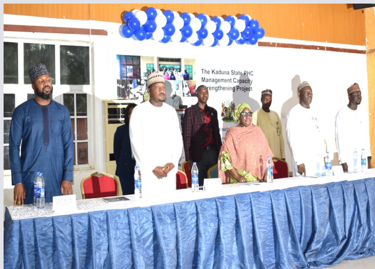
During the closeout event of the KPMSp in Kaduna, distinguished guests stand in unison for the National Anthem.