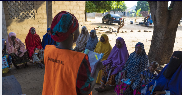
During a GANC session, a dedicated CHIP agent addresses a group of pregnant women

To ensure the success and sustainability of the