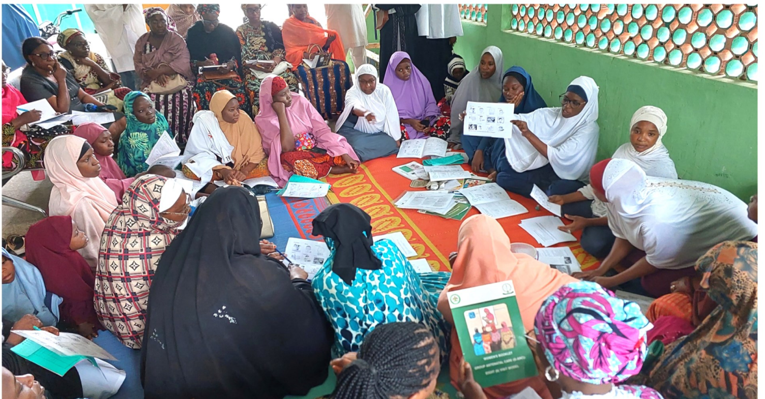
Healthcare workers actively engage pregnant women during GANC sessions as part of the recently concluded manual review workshop. The pilot testing and enhancements of the updated manual provide valuable insights, fostering potential improvements in maternal healthcare