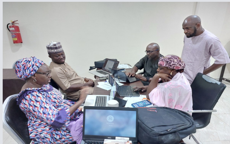
Participants engage in a collaborative brainstorming session during the GANC manual review workshop in Kano

Since 2021, TACConnect, in partnership with State Ministries of Health, State Primary Health Care Development Agencies, and Local Government Health Authorities and Departments, has been actively supporting seven states across Nigeria in adopting and implementing the G-ANC model. This alternative service delivery model has shown promising results, with increased facility deliveries, postnatal care services, and improved outcomes for mothers and newborns.